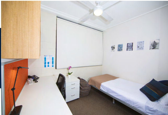
S BLOCK Single room with ensuite