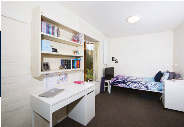
A, B, C & D BLOCK Single room with shared bathroom

Everyone's different - so we have mix and match options. Check the website for up to date costs.