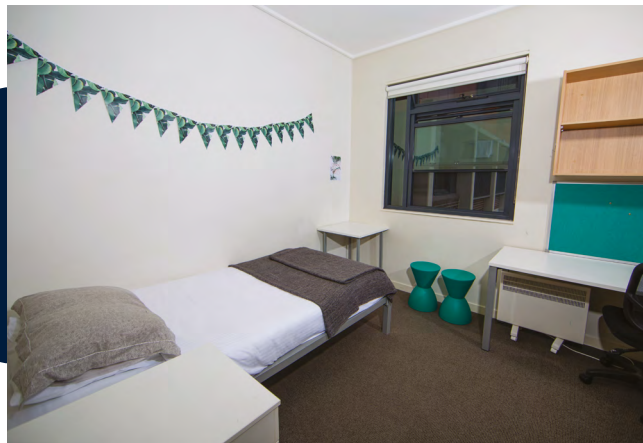
N BLOCK Single room with ensuite and kitchenette